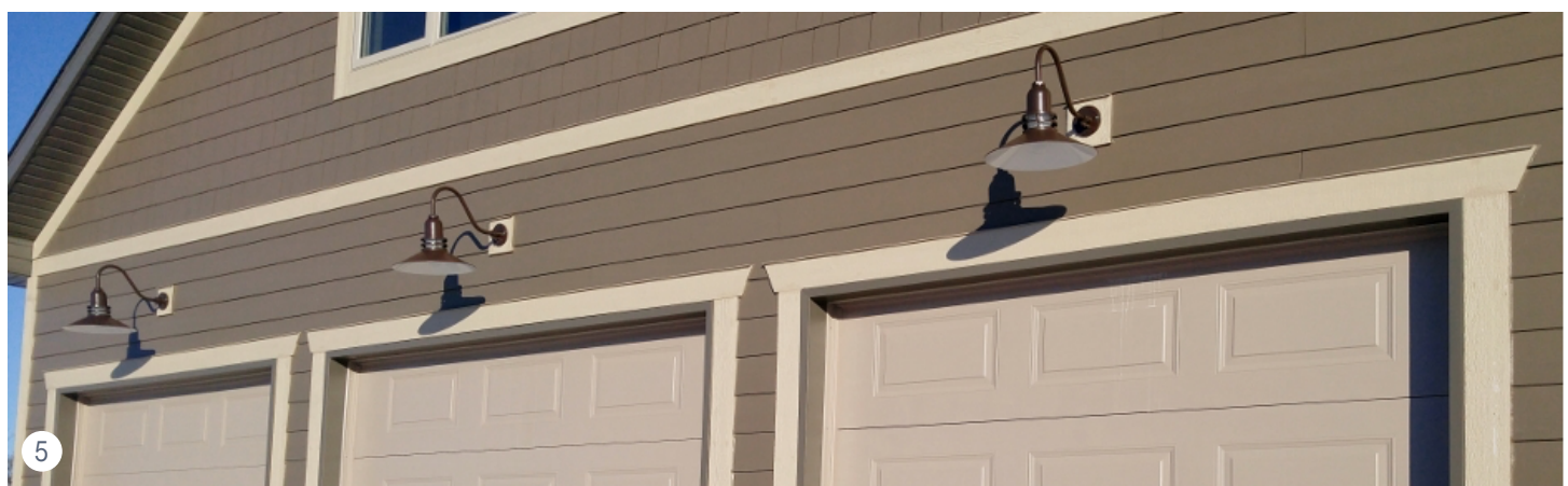
#1: (4) The Original™ Warehouse Gooseneck Light (20" Shades, 100-Black, G24 Gooseneck Arms in 975-Galvanized), #2: (3) The Original™ Warehouse Gooseneck Light (16" Shades, 150-Black, G34 Gooseneck Arms), #3: (3) Bomber Gooseneck Light (17" Shades, 350-Vintage Green, G19 Gooseneck Arms), #4: (3) Bomber LED Gooseneck Light (15" Shades, 650-Bronze, G14 Gooseneck Arms), #5: (3) Cherokee Uplight Gooseneck Light (16" Shades, 601-Chocolate, G11 Gooseneck Arms)