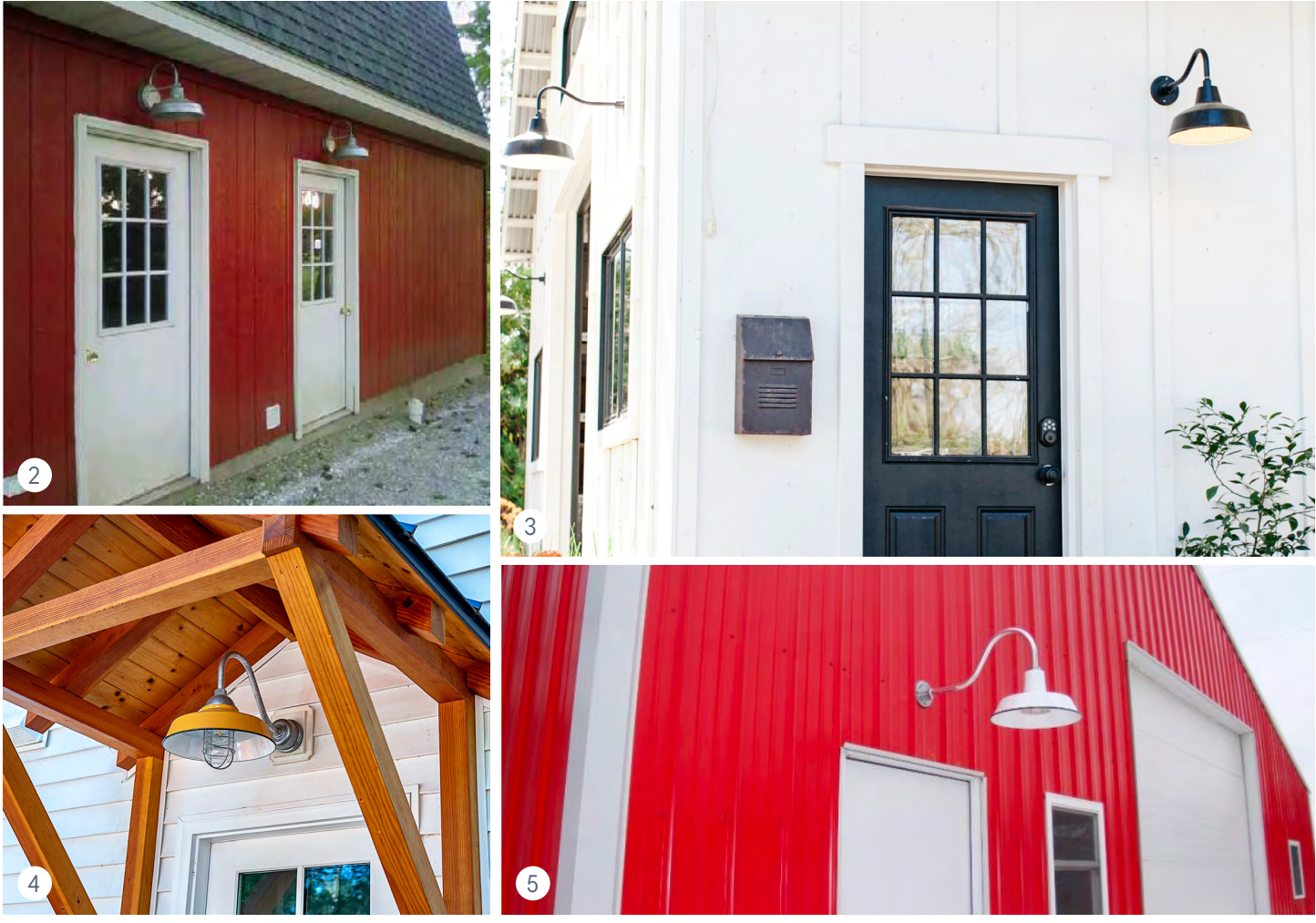
#1: (4) The Original™ Wall Sconce (14" Shades, 100-Black), #2: (2) Bomber Wall Sconce (13" Shades, 975-Galvanized), #3: All Weather Gooseneck Warehouse Shade (14" Shade, 100-Black, G31 Gooseneck Arm), #4: Rochester Vintage Industrial Gooseneck Light (14" Shade, 550-Yellow, G11 Gooseneck Arm in 975-Galvanized), #5: The Original™ Gooseneck Light (14" Shade, 250-White, G22 Gooseneck Arm in 980-Brushed Aluminum)

Many garages have side doors or "man doors" for easy access. To create a cohesive look to your garage lighting, consider using the same style of shade for the side door but in a smaller size. Thanks to Barn Light Electric's array of customizing options, there are multiple sizes, finish colors, and mounting options to choose from for all of our American-made lights.