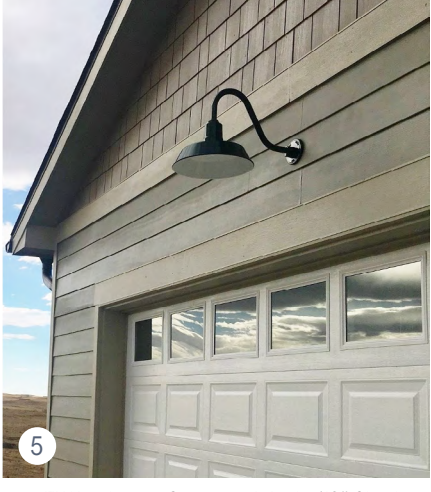
#1: (2) Dino Gooseneck Light (14" Shades, 100-Black, G15 Gooseneck Arms, Cast Guard & Clear Glass), #2: (2) The Original™ Warehouse Gooseneck Light (18" Shades, 615-Oil-Rubbed Bronze, G22 Gooseneck Arm), #3: Marathon Gooseneck Light (16" Shade, 150-Porcelain Black, G22 Gooseneck Arm), #4: (2) Chestnut Gooseneck Lights (16" Shades, 995-Raw Copper, G15 Gooseneck Arms), #5: The Original™ Warehouse Gooseneck Light (14" Shade, 300-Dark Green, G15 Gooseneck Arm)