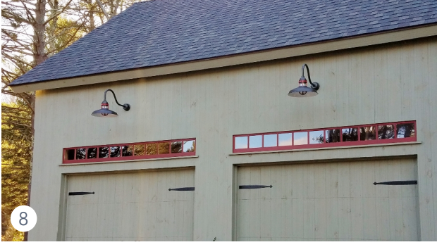
#1: (2) Double Market Industrial Guard Sconce (400-Barn Red, TGG-Heavy Duty Guards & Ribbed Glass), #2: (2) Laramie LED Gooseneck Light (16" Shades, 100-Black, G32 Gooseneck Arms), #3: (2) Avalon Gooseneck Light (10" Shades, 105-Textured Black, G26 Gooseneck Arms), #4: (2) Avalon LED Gooseneck Light (10" Shades, 390-Teal, G11 Gooseneck Arms), #5: Bridgeport Vintage Industrial Gooseneck Light (14" Shade, 150-Black, G15 Gooseneck Arm in 975-Galvanized), #6: (2) Avalon Wall Sconce (12" Shades, 100-Black), #7: (2) The Original" Warehouse" Gooseneck Light (18" Shades, 100-Black, G22 Gooseneck Arms in 975-Galvanized), #8: (2) Brisbane Gooseneck Light (14" Shades, 600-Bronze, 400-Barn Red Cast Guards, G22 Gooseneck Arms)